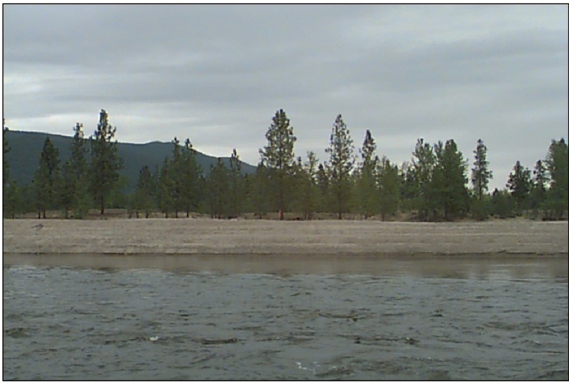
RIGHT BANK VIEW