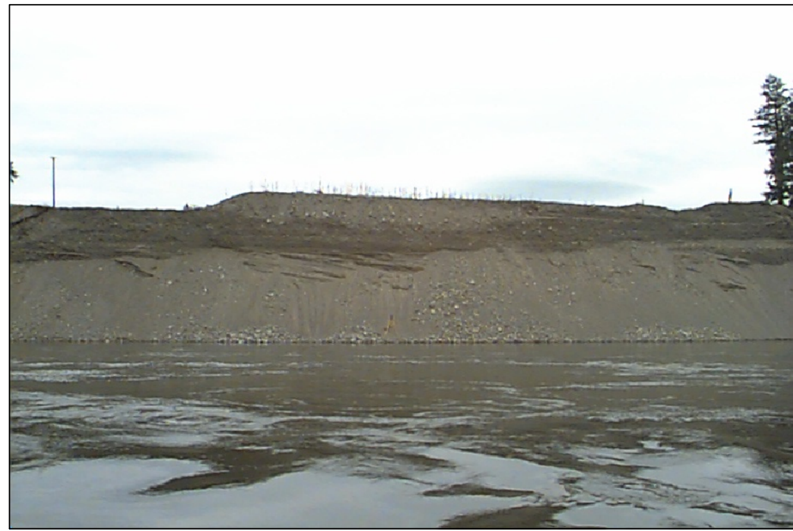
LEFT BANK VIEW